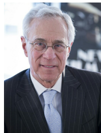
Colonel Jack Jacobs

Co-Chief Investment Officer Royce & Associates, LLC