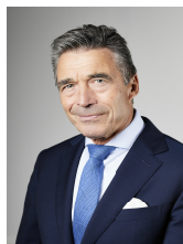
Anders Fogh Rasmussen

Former Prime Minister of Denmark & Head of NATO